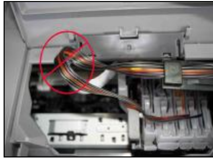
2. Twisted Tube